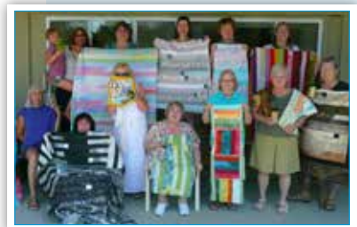
Creative Quilt Camp

“Something I learned on the trip: If I push myself enough I can do anything. (and) The environment is very diverse.” ~ Women on the Water Participant, Women in Natural Sciences, Philadelphia, PA